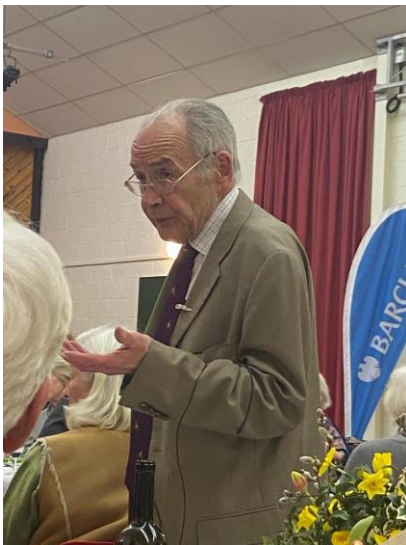
Alastair Stewart holds the audience captivated with his tales of life in the news media