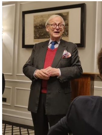
Lord Deben In full flow!